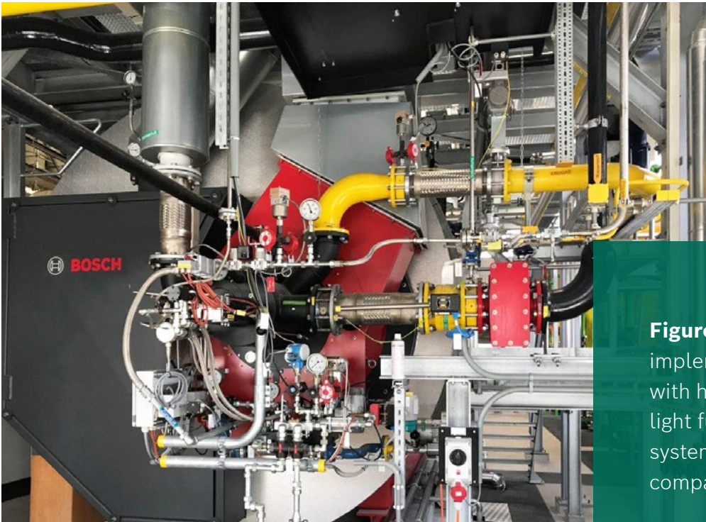
Figure 2: Example of an implemented fuel concept with hydrogen, natural gas and light fuel oil for a Bosch boiler system at a pharmaceutical company.